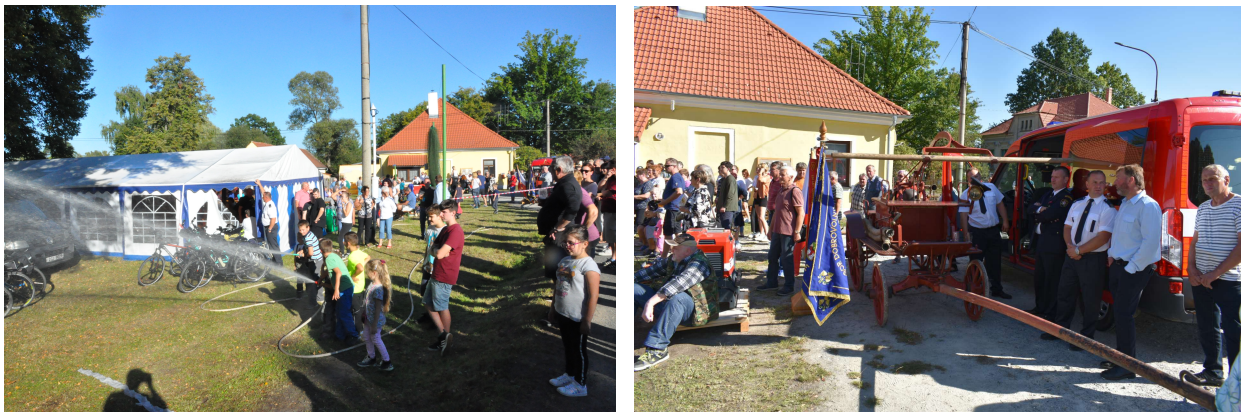
Right: the ancient and a new fire car, with the Volunteer Fire Brigade in full uniform. Left: playing with water is always fun.