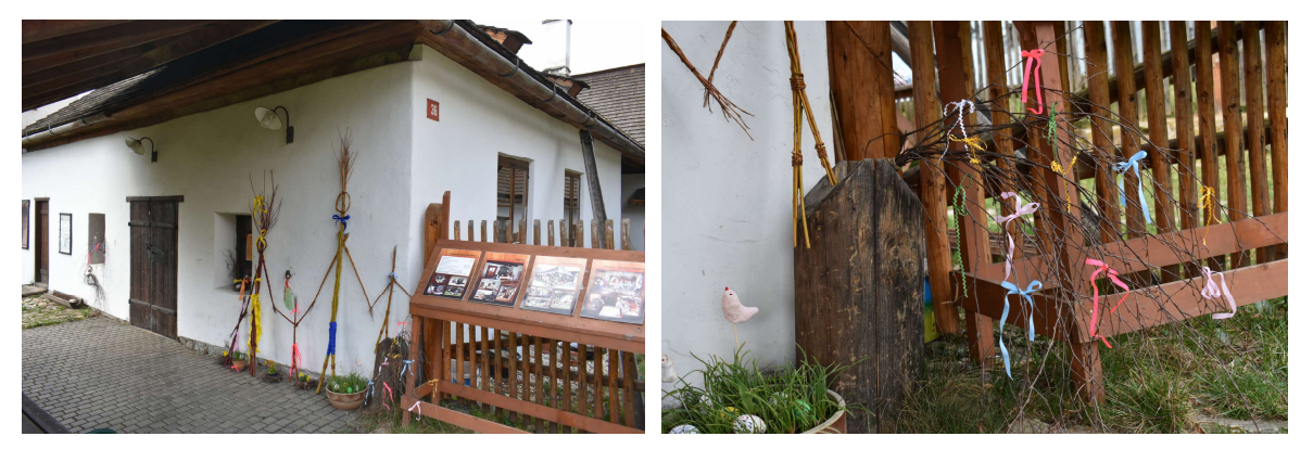
Easter decoration outside the smithy for people to enjoy during a stroll through the town.

Due to the COVID-19 pandemic and lack of staff, the Easter event and Mikulas had to be cancelled.